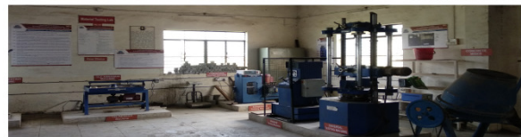
Material Testing & Concrete Technology Lab