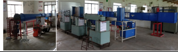
Fluid Mechanics Lab